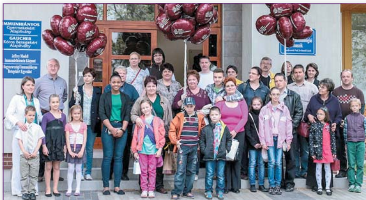
Preparation for balloon launch