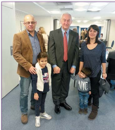
Together with parents and children from Brassow