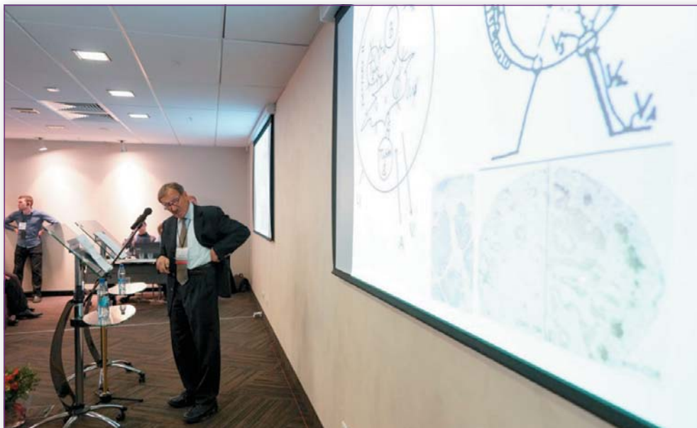
Rolf M. Zinkernagel presenting his Keynote lecture

Internationally recognized scientists and young researchers presented their lectures and reports in 3 sessions. Debates and discussions about presented material were active and interesting, was attended by both well-known Russian scientists and Nobel laureate Rolf Zinkernagel Martin.