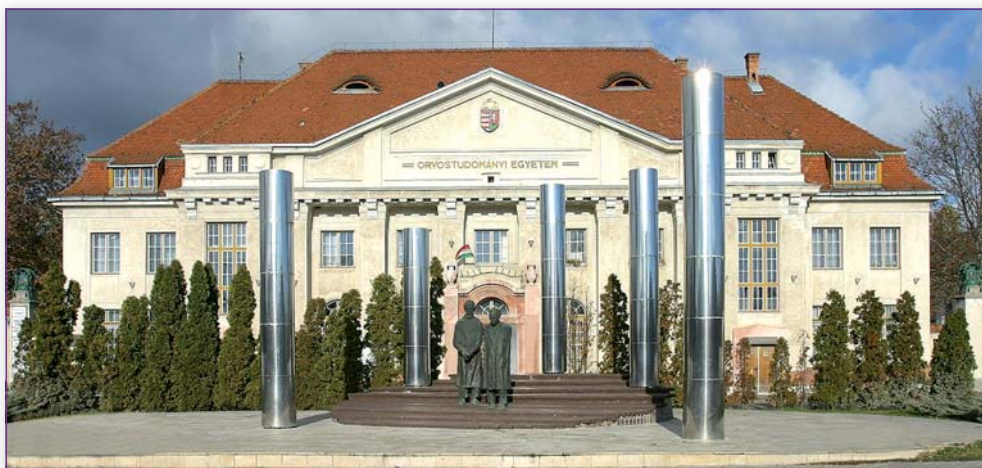
University of Debrecen, Clinical Center

The East-Central-European Infectious and Pediatric Immunology Center for Training and Research (ECE IPI CTR) was established on December 22, 1999. From educational and scientific points of view, the Center is closely associated with the Department of Infectious and Pediatric Immunology at the University of Debrecen . The Department has a strong profile of immunology including research into antimicrobial host defense mechanisms. The main fields of research activity of the Department are as follows: